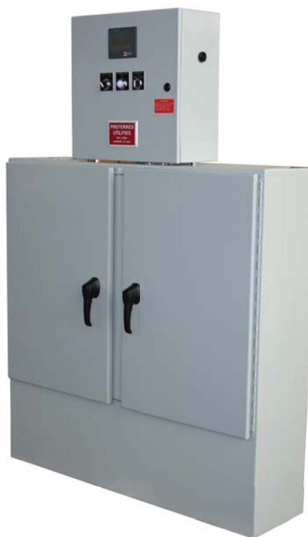
Model PF Automatic Fuel Oil Filtration Set

The separated contaminants and water are monitored by an integral filter water level detector. Depending on the size of the system, this waste water is piped to an optional Waste Water Holding & Removal System or connected directly to the customer's waste tank (by others). A differential pressure switch/indicator is installed around the filter units to provide a visual indication of filter element condition. An alarm notifies plant personnel when the filter elements require replacement.