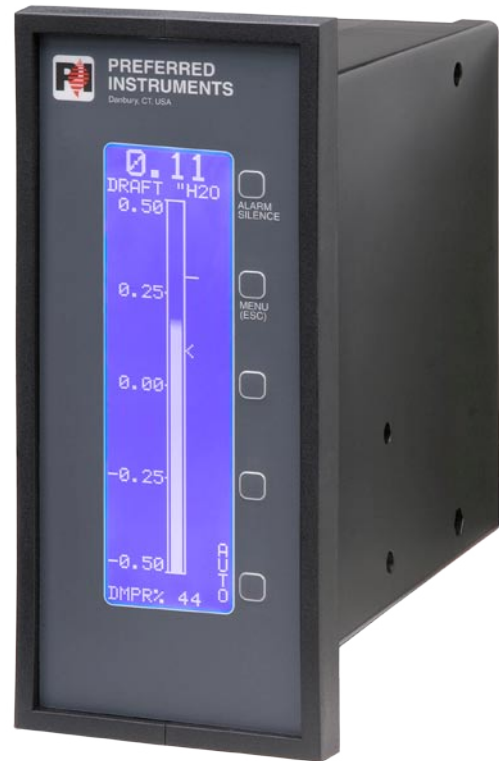
JC-22D Draft Controller