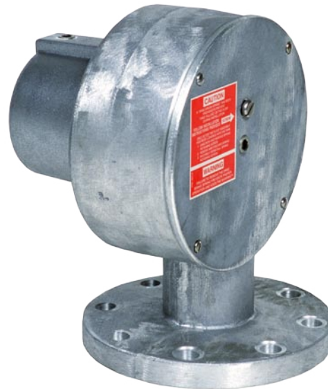
TG-EL-WF Level Probe